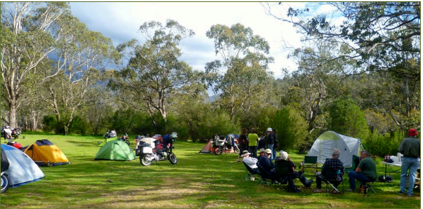
Geehi rally site