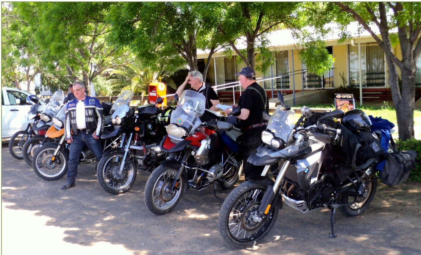
Booligal NSW, one Pub, no petrol

The beer was cold and sausage roll hot, so all was good in the world and more dirt to be had 😊