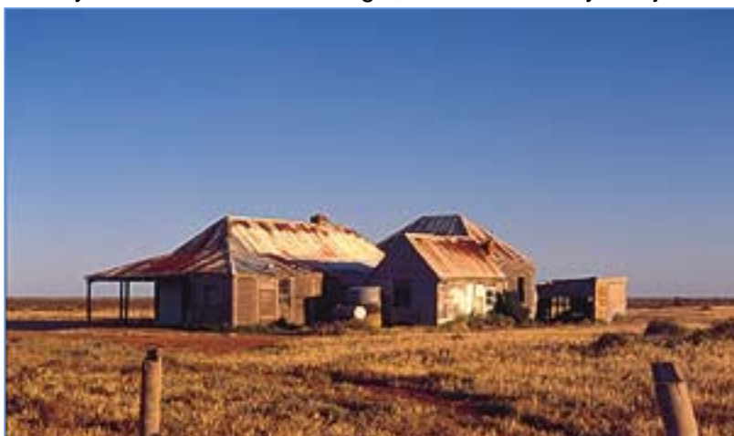
One Tree Hotel, NSW. On the droving route from western NSW to Echuca and paddle steamers of the 1800s. Closed 1942.