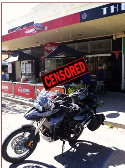
Old Hume Cafe, Gunning