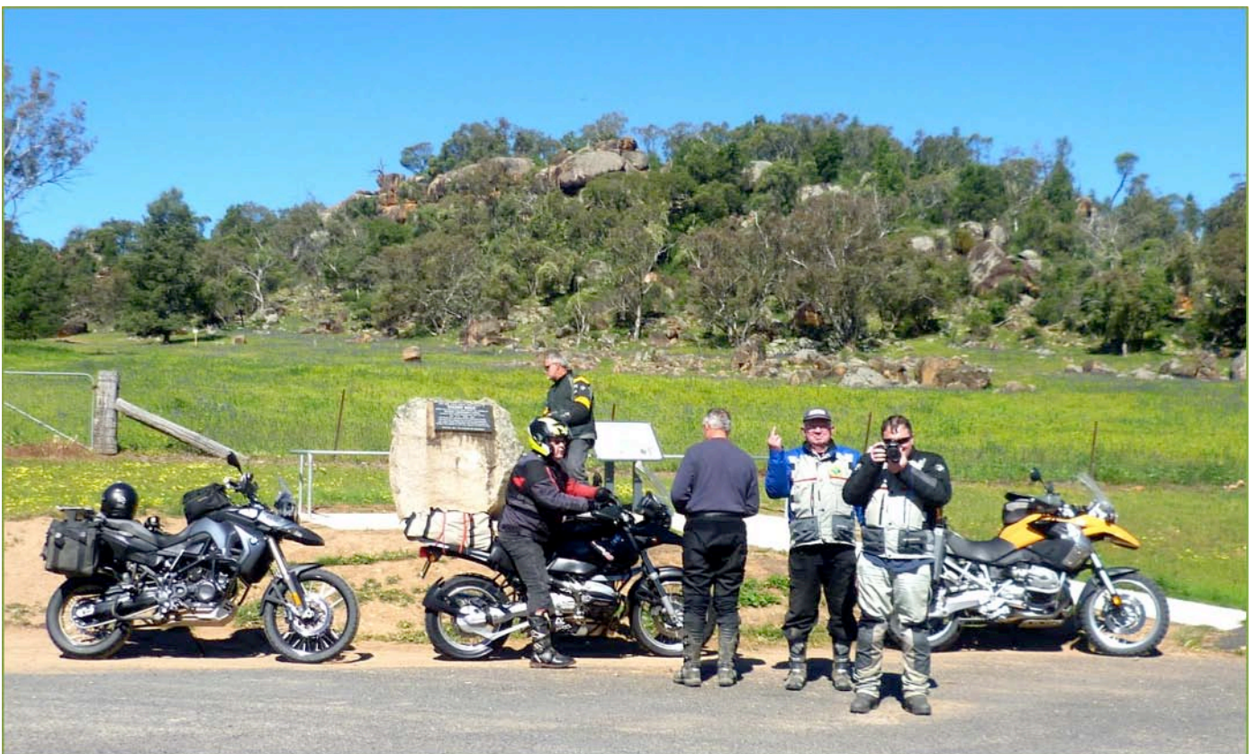
Escort Rocks, Eugowra