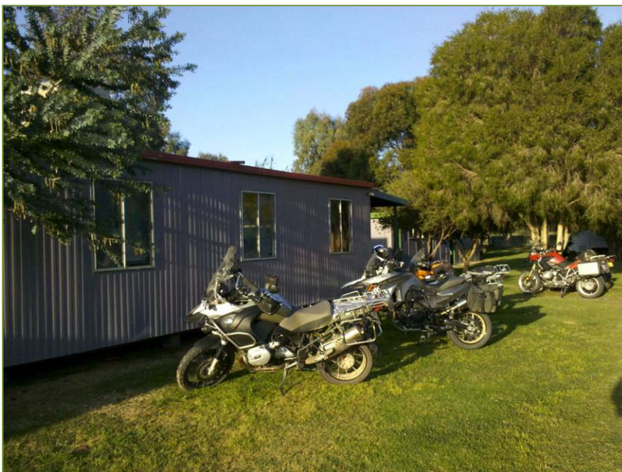
The Maude Hotel Caravan Park and on-site 'Dongas'.