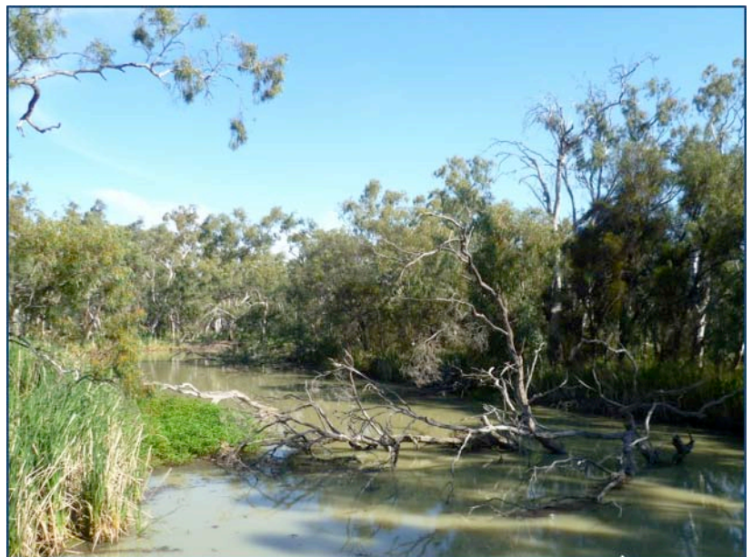
Lachlan River, Oxley Bridge - view towards Great Cumbung Swamp

At Maude we caught up with Bruce and Andrew (Andrew having pulled over S of Booligal and missing us at the One Tree turn off - his focus no doubt being on the road train about to pull out in front of him at One Tree). I topped up the tank of my GS at the general store, and then booked into the Post Office Hotel. The 8 rooms were clean but spartan twin arrangements, all within a mining camp donga. The tariff was a measly $25, which included a continental breakfast. After getting ourselves sorted into the accommodation, it was time to relax, meet the locals and get a refreshing drink. The pub's licensee was a German lady, Lydia, who had her parents from Germany over for a holiday (after landing in Sydney, they had virtually spent all their time at Maude, helping their daughter with the pub it would seem). The evening meal was excellent and our host was very accommodating in staying open so that we could watch the Aragon MotoGP live, before retiring for the night.