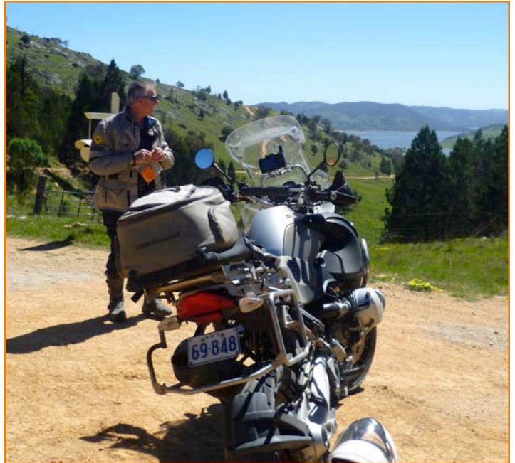
Tarrants Gap Road - Wyangala Dam view