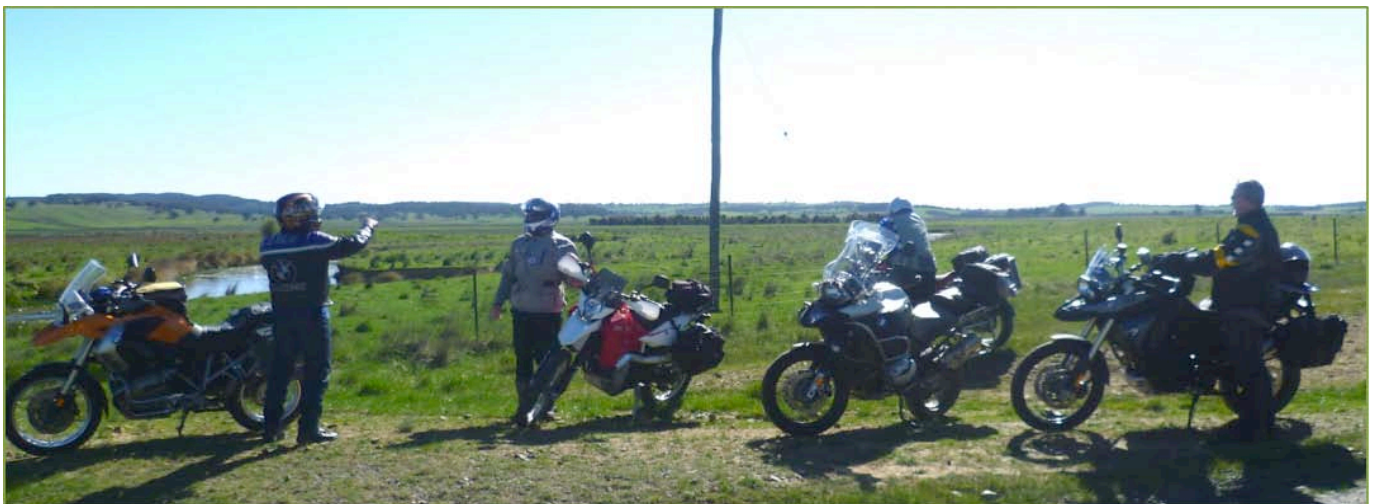
Old South Road, Mutmutbilly Creek - Lachlan River Source in flat ground in distance